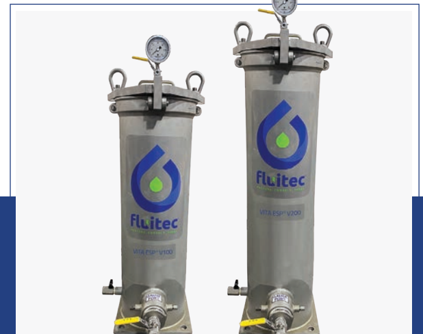
VITA ESP™ V100 & V200