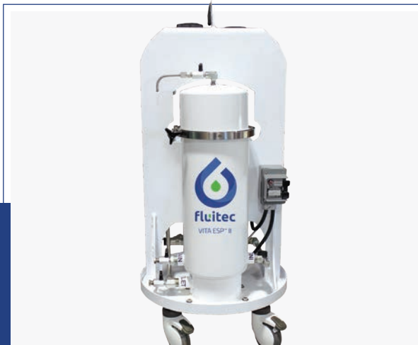
VITA ESP™ II

It chemically targets and removes contaminants through strong adsorption forces, ensuring they are not released back into the oil. ESP has a high capacity, utilizing the full volume of the media, not just the surface area.