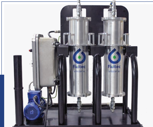
VITA ESP™ III